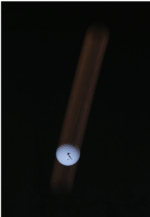
Fig 1: Rear Curtain Sync using Canon's technology. Note: streak below golf ball. Camera: 7D; Shutter Speed: 1/10th; Aperture: f/5.6; Lens: EF 50mm f/2.5 Macro

We found in testing that the Canon system rear curtain sync timing is actually not at the precise end of the shutter opening, but actually slightly before (Fig 1). We have been able to improve on this timing to put the flash at the very end of the exposure (Fig 2).