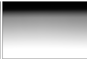
Canon EOS 6D 1/2000 f/11