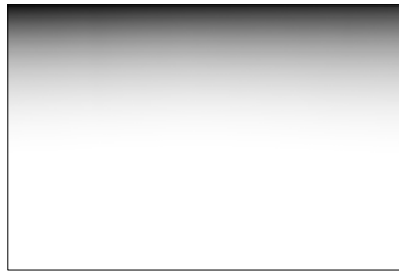
Canon EOS 6D 1/640 f/11