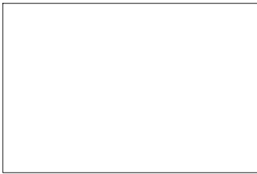
Canon EOS 6D 1/200 f/11