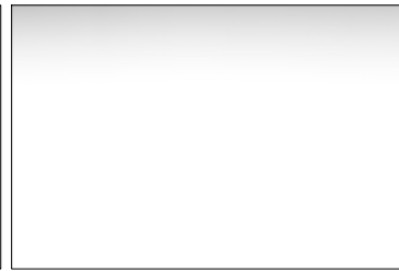
Canon EOS 6D 1/320 f/11