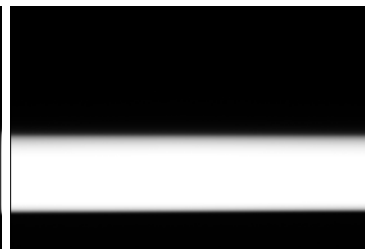
Canon EOS 6D 1/2000 f/11