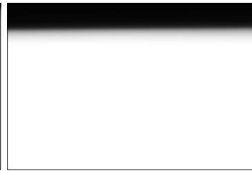
Canon EOS 6D 1/320 f/11