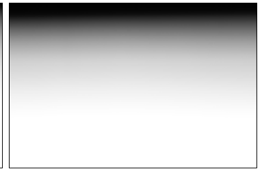
Canon EOS 6D 1/1000 f/11